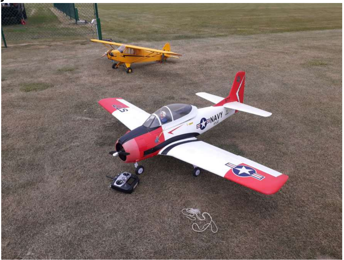
JULY I ST PHOTOS - WHAT A DAY!