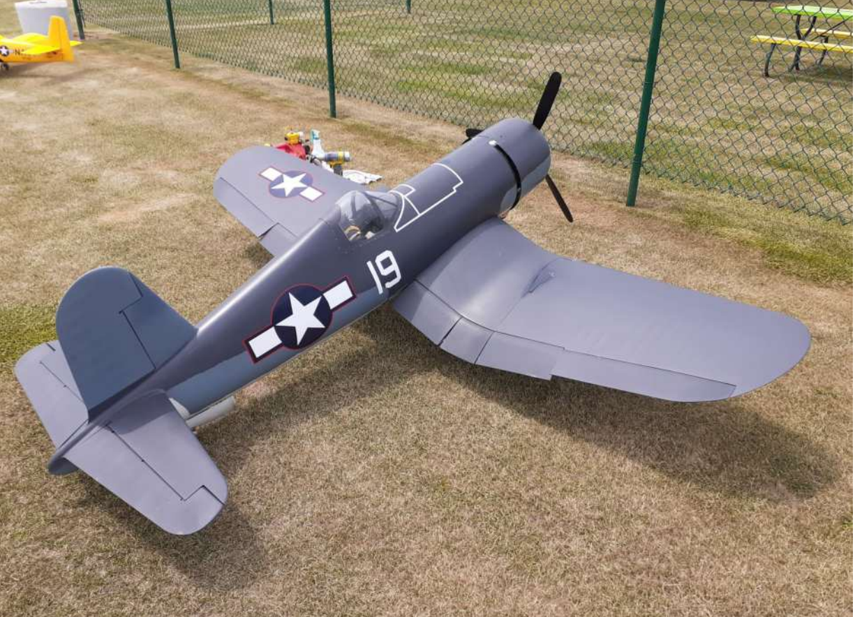
FDLAA July 2023 Newsletter