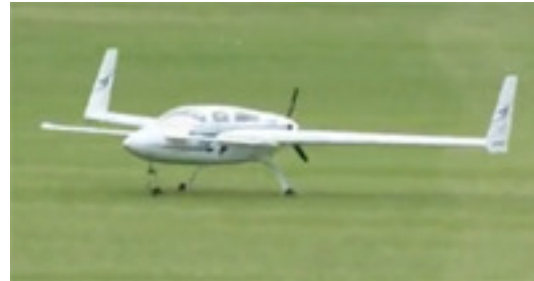
This is Armond P's Velocity powered by a 1.20 Nice job Armond!!